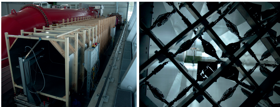
Figure 1. The picture on the left shows the Prandtl tunnel, whose inlet is in the distance, and whose outlet is in the foreground. The length of the test section is 10 m. The red Variable Density Turbulence Tunnel is visible next to the Prandtl tunnel. The picture on the right is a view down the length of the Prandtl tunnel through the active grid. The active grid consists of 129 independently position-controlled diamond-shaped paddles that tile the cross section of the tunnel. The mesh size, M , of the grid is 163 mm, measured along the diagonal of the paddles.

Active grids were developed only recently as a way to generate in wind tunnels high-Reynolds number flows with convenient properties [1]. Active grids work by stirring the flow with rotating paddles, rather than disturbing it through the wakes of stationary bars, as in a classical grid. Modern active grids generate not only high-Reynolds number flows, but also flows with tailored properties [2]. Such control is desirable where turbulence with certain statistical properties is needed, as is the case when the atmospheric boundary layer needs to be synthesised to observe its effect on wind turbines [3], or where the effects of variation of the large-scale properties of the turbulence on the small-scale dynamics need to be understood, which is one objective of fundamental turbulence research [4]. The nature of the large-scales is set by the geometry of the apparatus in an experiment. One advantage of the active grid is that its geometry is variable and can be adjusted during its operation. In the time since the first active grids [5, 6], our understanding of how to control the flow by changing aspects of the grid has advanced, but is not yet mature. Our active grid represents a next step in this progression.