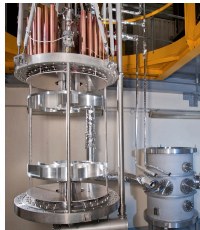
(b) Picture of the experiment partially assembled.